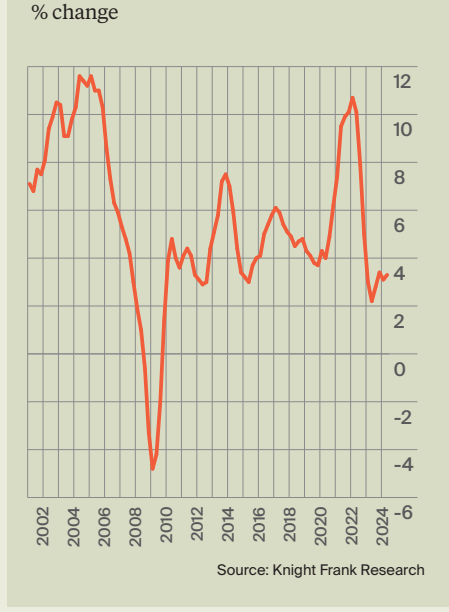
Fig 1: The Knight Frank Global House Price Index 2024 Q2 edition, overall index annual