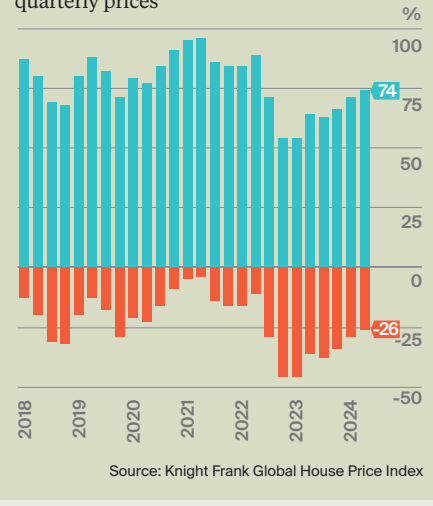
Fig 3: Rate cuts outpace hikes

Proportion of markets with rising or falling quarterly prices